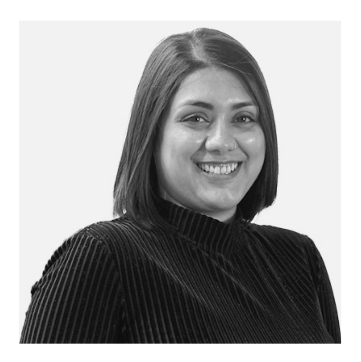
240520 - GG (A Girl) & Anor, Re [2024] EWFC 101 (B)(FLW) | 21st May 2024